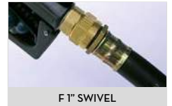
F 1" SWIVEL