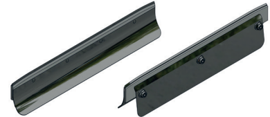
SPARE CARBIDE BLADE