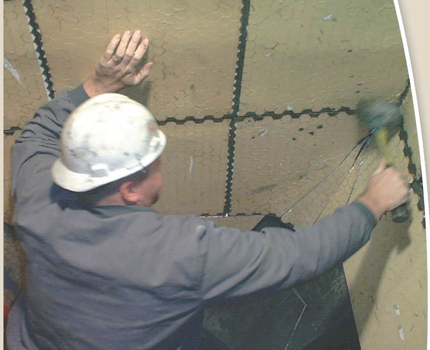
Remalox being installed in a coal hopper

The tiles have an extremely high bond strength to the rubber backing so they stay in place.