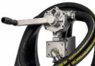
Art. 027-3720-000 Alluminium manual rotary pump