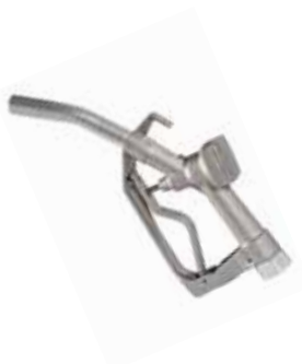
Art. 093-5200-000 Manual nozzle “MC 80” Flow rate 80 l/min