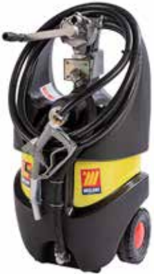
Art. 090-6055-M00 Wheeled Caddy Tank 55 l diesel